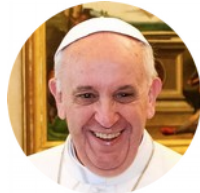
Pope Francis @pontifex

None of us can think we are exempt from concern for the poor and for social justice (EG 201).